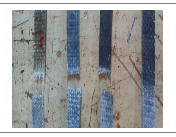
Figure 1: Tensile Specimens with 0%, 5%, 10% and 20% Fly Ash Content